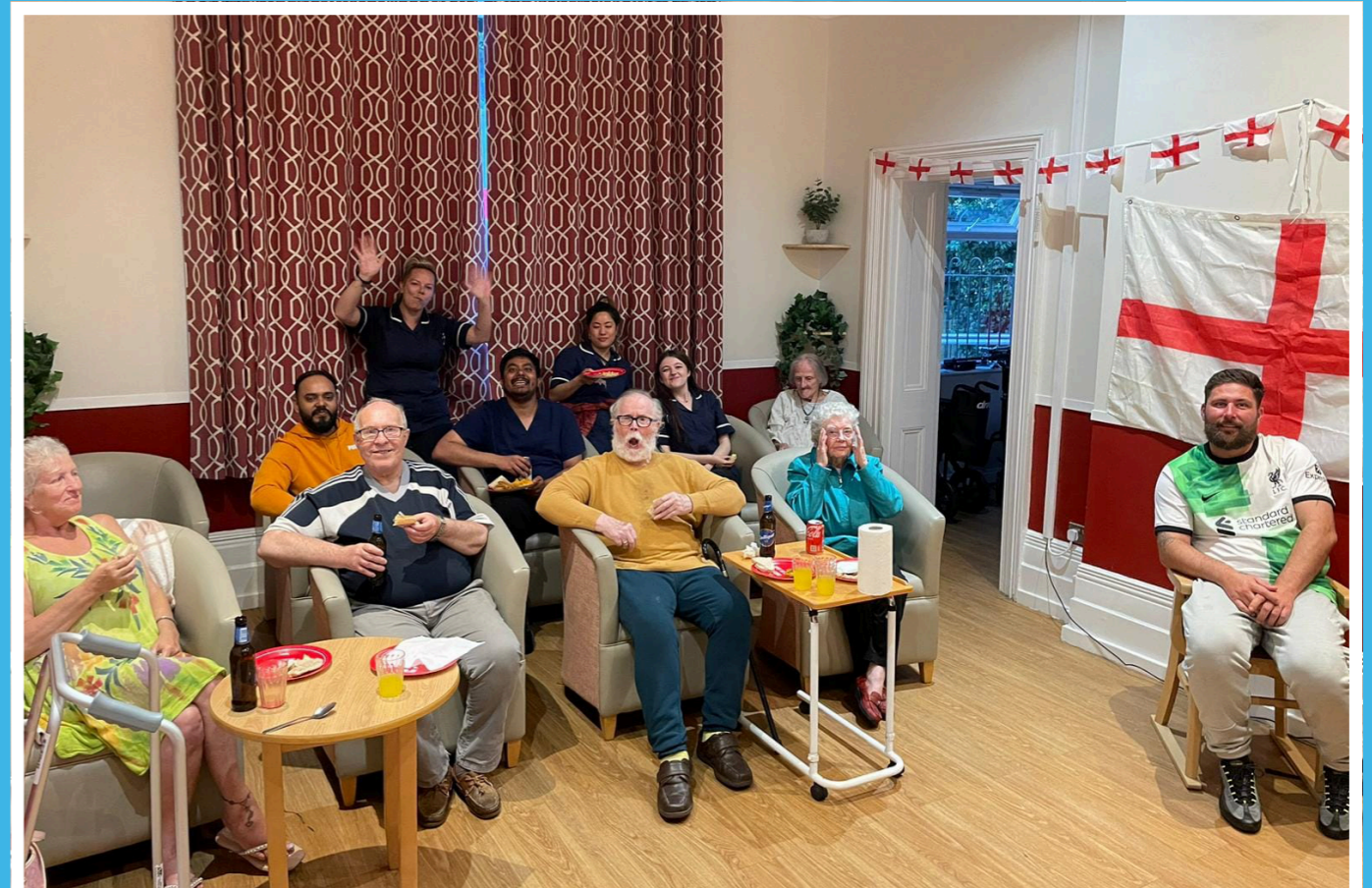
The finals were a great opportunity to kick back, relax, and calm some of the nerves with a beer.