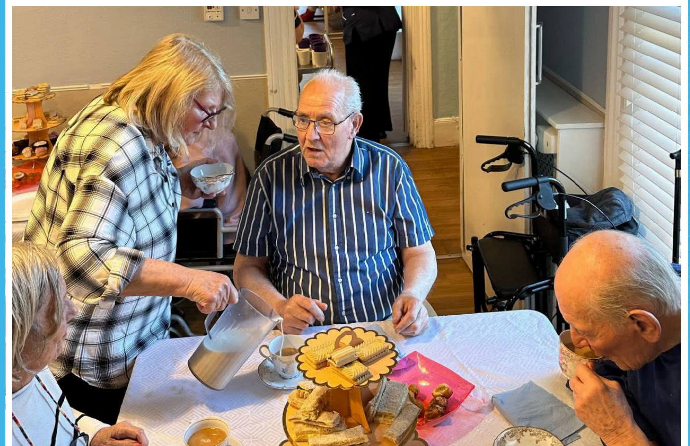
Top-ups all round!