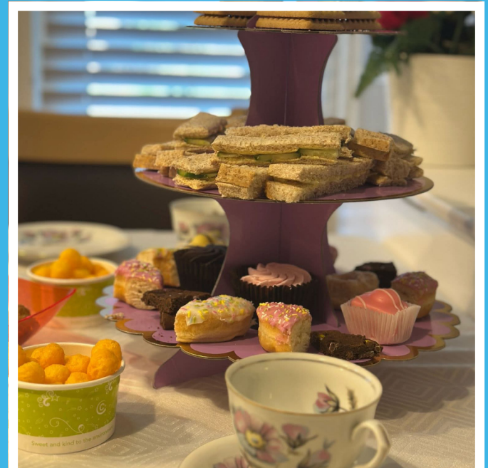
Sweet treats & sarnies stacked high!