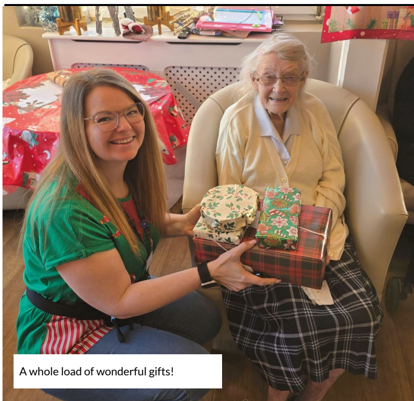
A whole load of wonderful gifts!

A huge thank you goes to the Whitfield team, whose hard work, care and attention made the celebrations so special. Their dedication helped create a warm, joyful Christmas filled with smiles, surprises and festive cheer for everyone involved.