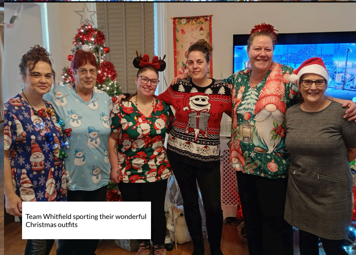
Team Whitfield sporting their wonderful Christmas outfits