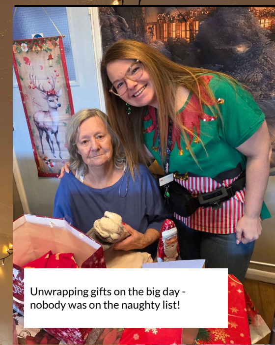
Unwrapping gifts on the big day - nobody was on the naughty list!