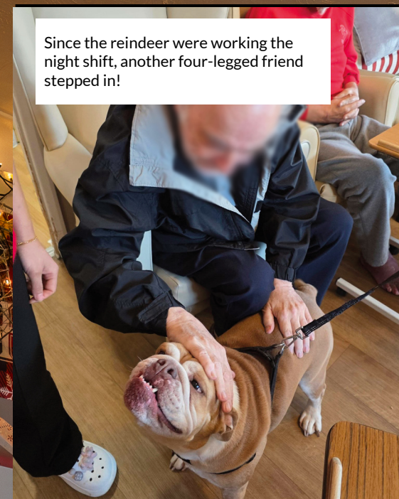
Since the reindeer were working the night shift, another four-legged friend stepped in!