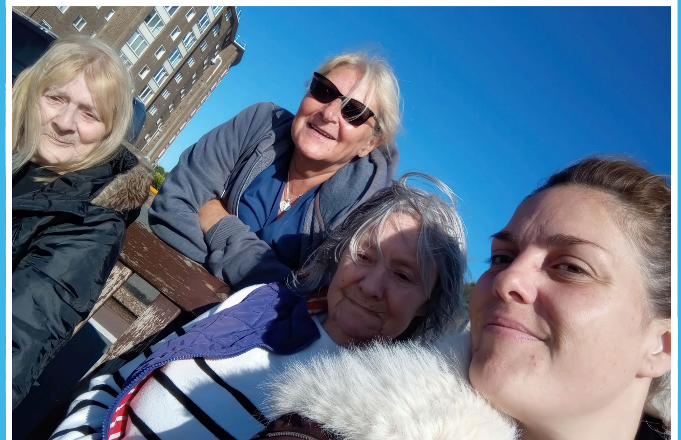
A group selfie out on the seafront - smiles all around!