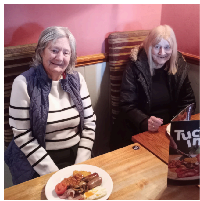
Some delightful breakfast from Table Table to start off the morning!

They kicked things off with a delicious breakfast at Table Table, soaking up the morning sun and good company. That was followed by a refreshing walk along Dover seafront, taking in the beautiful views and fresh sea air. To round off the trip, we popped into Home Bargains for a spot of leisurely shopping!