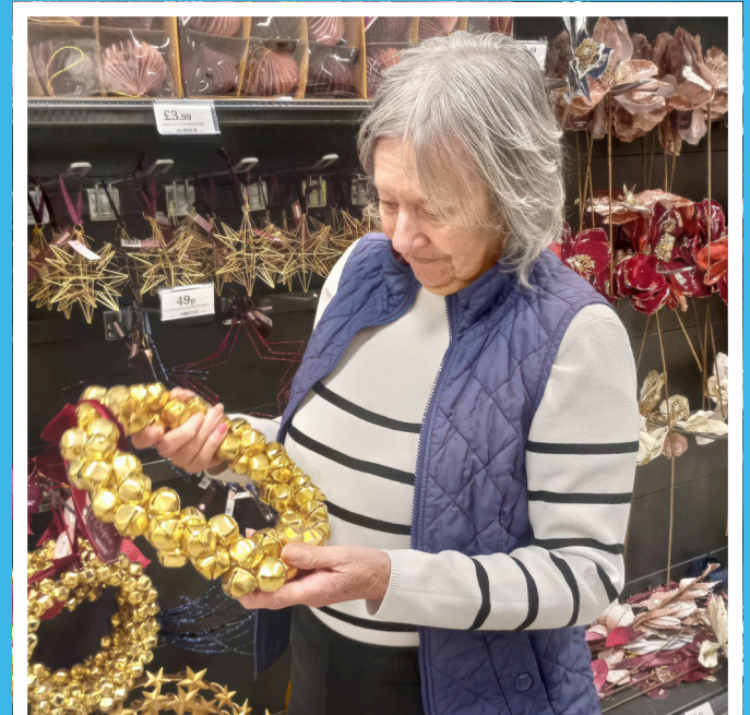
It's never too early to get the Christmas stuff on display... or is it?