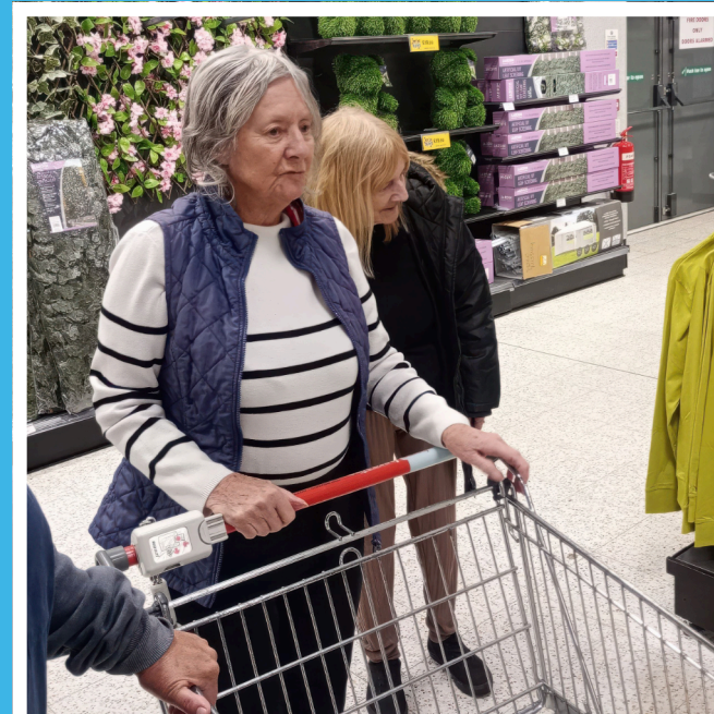
Bellies full and on to Home Bargains!