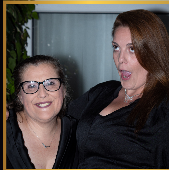
That face when you're hit with the flash on full power...